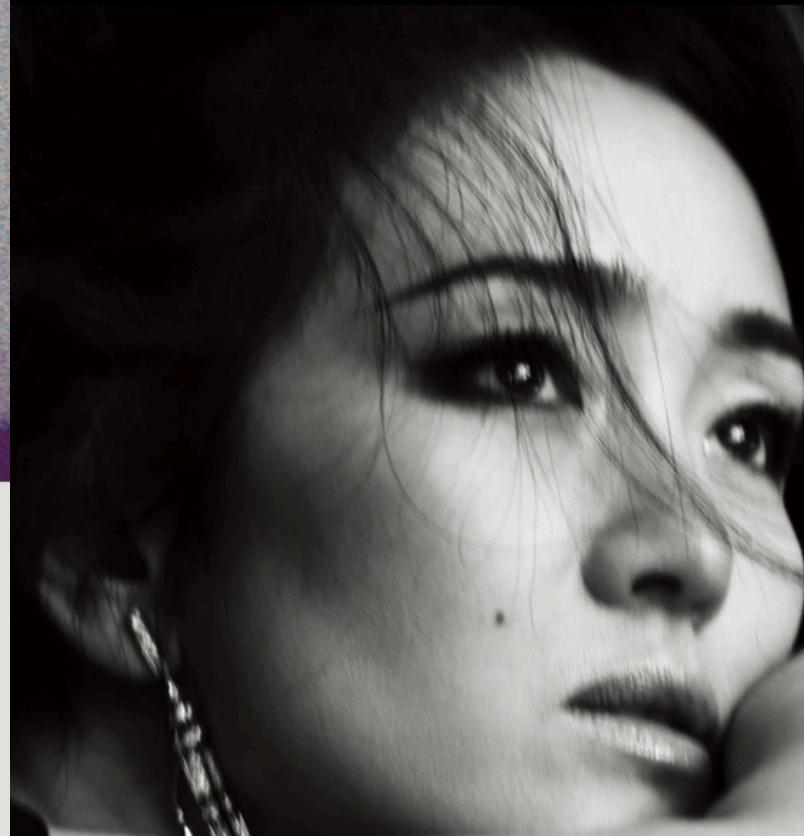
GONG LI WAIFF's President / 2026 edition