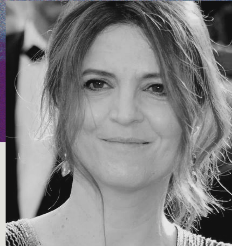
AGNES JAOUÏ WAIFF's President of the Jury / 2026

Honored as Commander of the Order of Arts and Letters in France